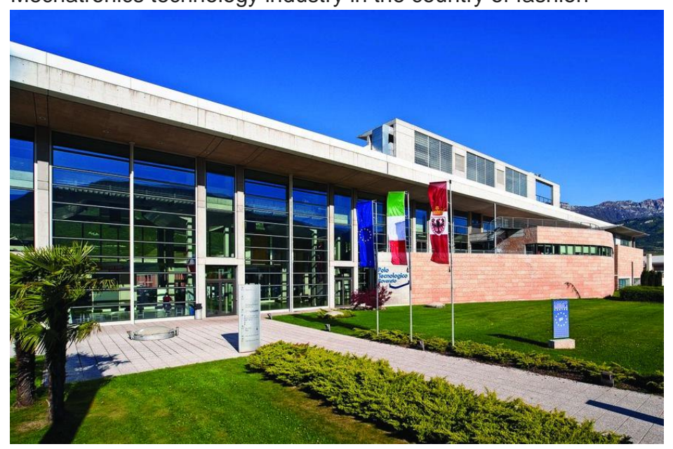
Trento, Italy Mechatronics technology industry in the country of fashion

In Italy, the creative fashion center of the world, believing in the transformation force of design, we are in the region of Trento, one of the most important poles of mechatronics technology in Europe.